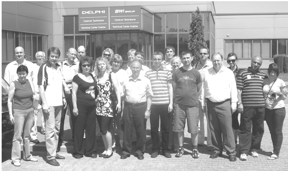
Fig. 8. Conference participants during visiting Delphi Poland S.A. Рис. 8. Участники конференции во время посещения фирмы DELPHI