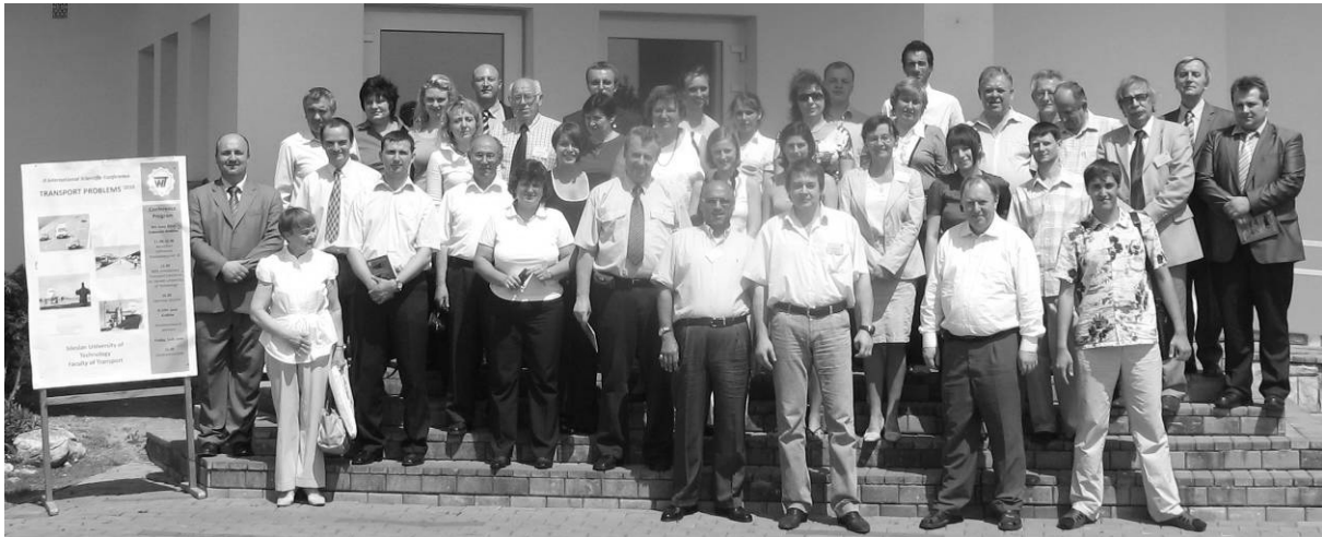
Fig. 7. Conference participants after session of one of sections in Krakow Рис. 7. Участники конференции после заседания секции в Кракове