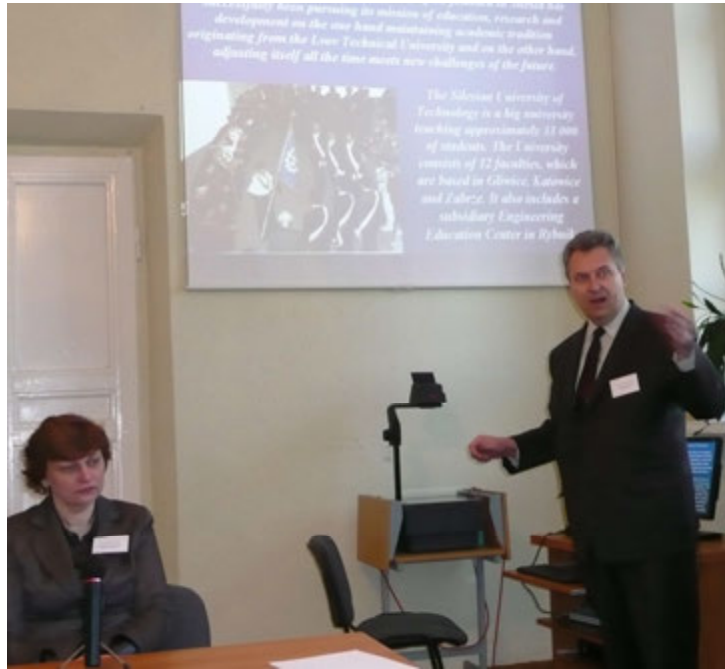
Fig. 3. The presentation of the prof. Aleksander Sładkowski in Vilnius College of Technologies and Design