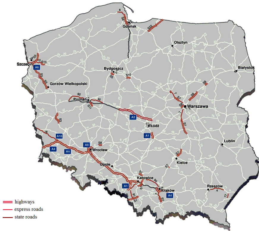
Figure 1 Map of Poland with the specified sites of toll roads

Note that Poland is not an exception in this case, and is also not the first country in Europe where the same or a similar system has been introduced. In particular, Germany is using the Toll Collect system, Austria GO system, Myto cz system is implemented in Czech Republic, Myto sk system in Slovakia, Telepass and ViaCard systems in Italy, TIS-PL system in France, Via T system in Spain and the LSWA system in Switzerland. In addition, a number of European countries use the opportunity to pay road tolls using electronic cards – DKV Card. The task of the authors did not include discussion on the advantages or disadvantages of one or the other system of electronic payments, as well as its design features. The main principles of work and organizational design are available on the viaTOLL official website [3]. Authors of this paper were interested, what specific effects will the introduction of this system bring to the transport operations in this specific region of Poland.